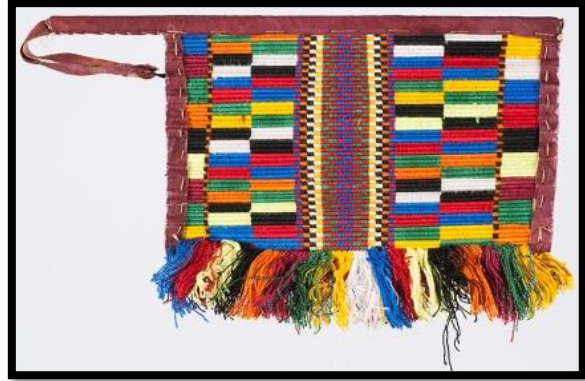
unknown Hausa-Fulani maker woven fan

This activity features a woven mat and fan made by people living in Nigeria.