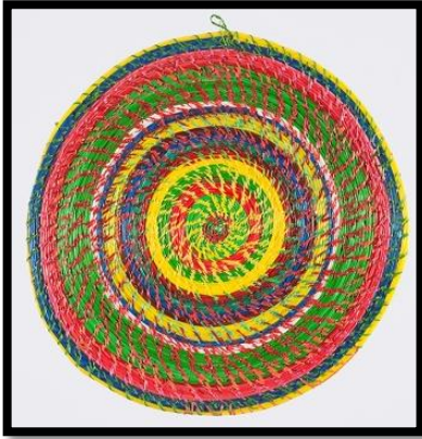
unknown Hausa-Fulani maker woven basketry food cover or mat