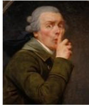
Joseph Ducreux Le Discret

This activity highlights three portraits from the Spencer Museum's collection.