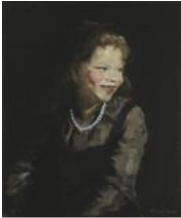
Robert Henri Laughing Girl