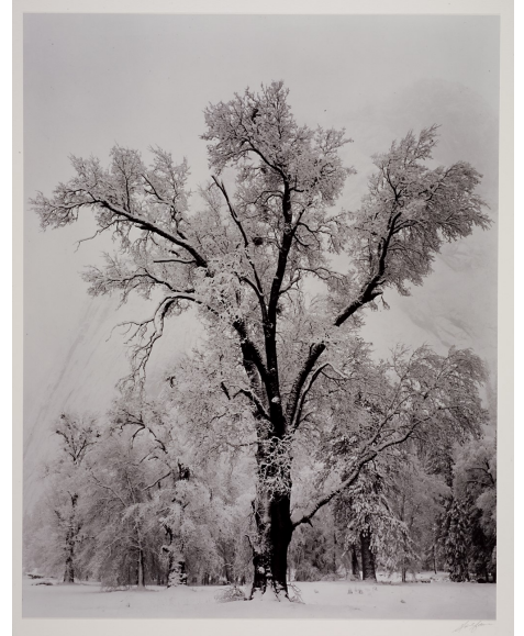
Ansel Adams, Oak Tree, Snowstorm, Yosemite National Park, California

This activity is inspired by the beauty of trees, especially during the winter months.