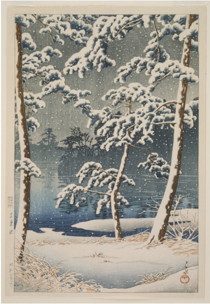
Kawase Hasui, Senzoku no Ike ( Snow on Senszoku Pond )