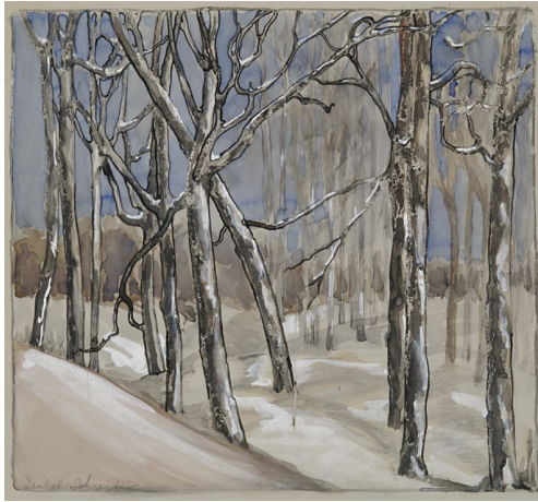
Isabel Schreiber, untitled