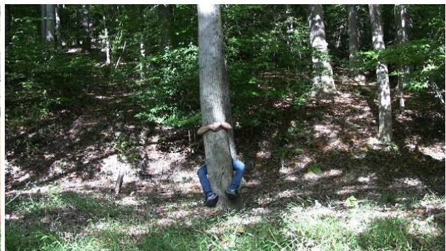
Images: Michael Krueger's "Green River," Cari Freno's "Tree Jump" (video still).